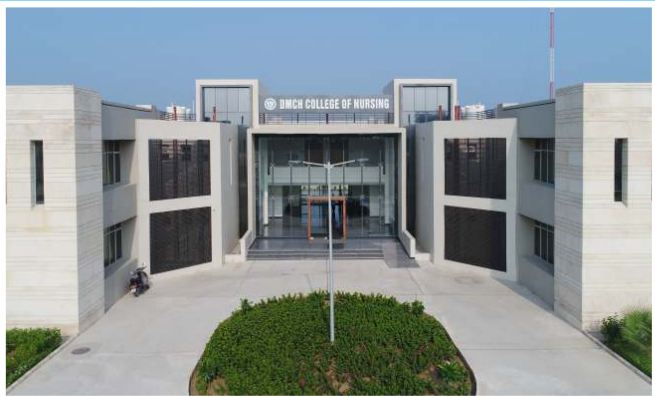
COLLEGE OF NURSING