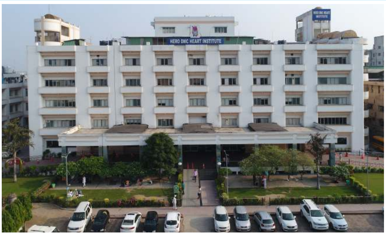
UNIT-HERO DMC HEART INSTITUTE