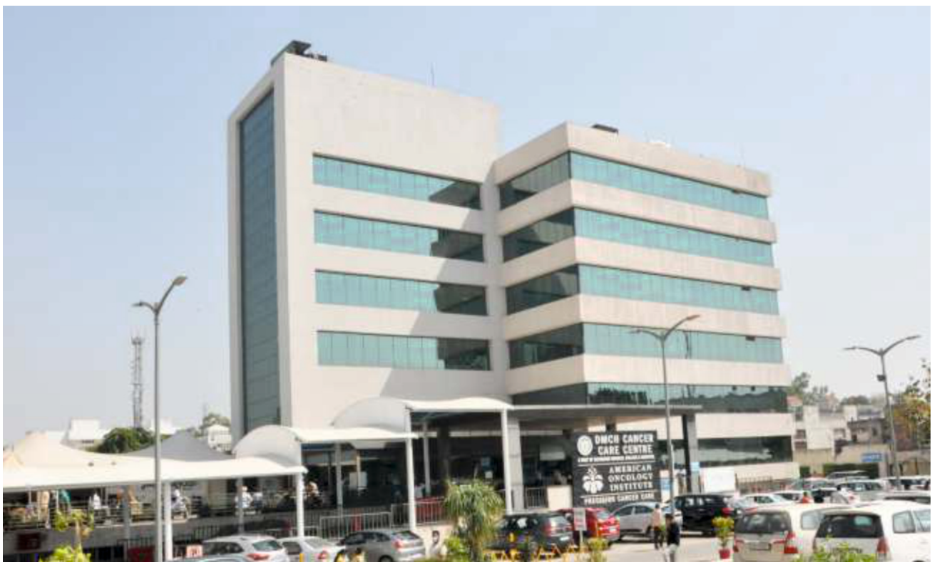
STATE OF THE ART - CANCER CARE CENTRE