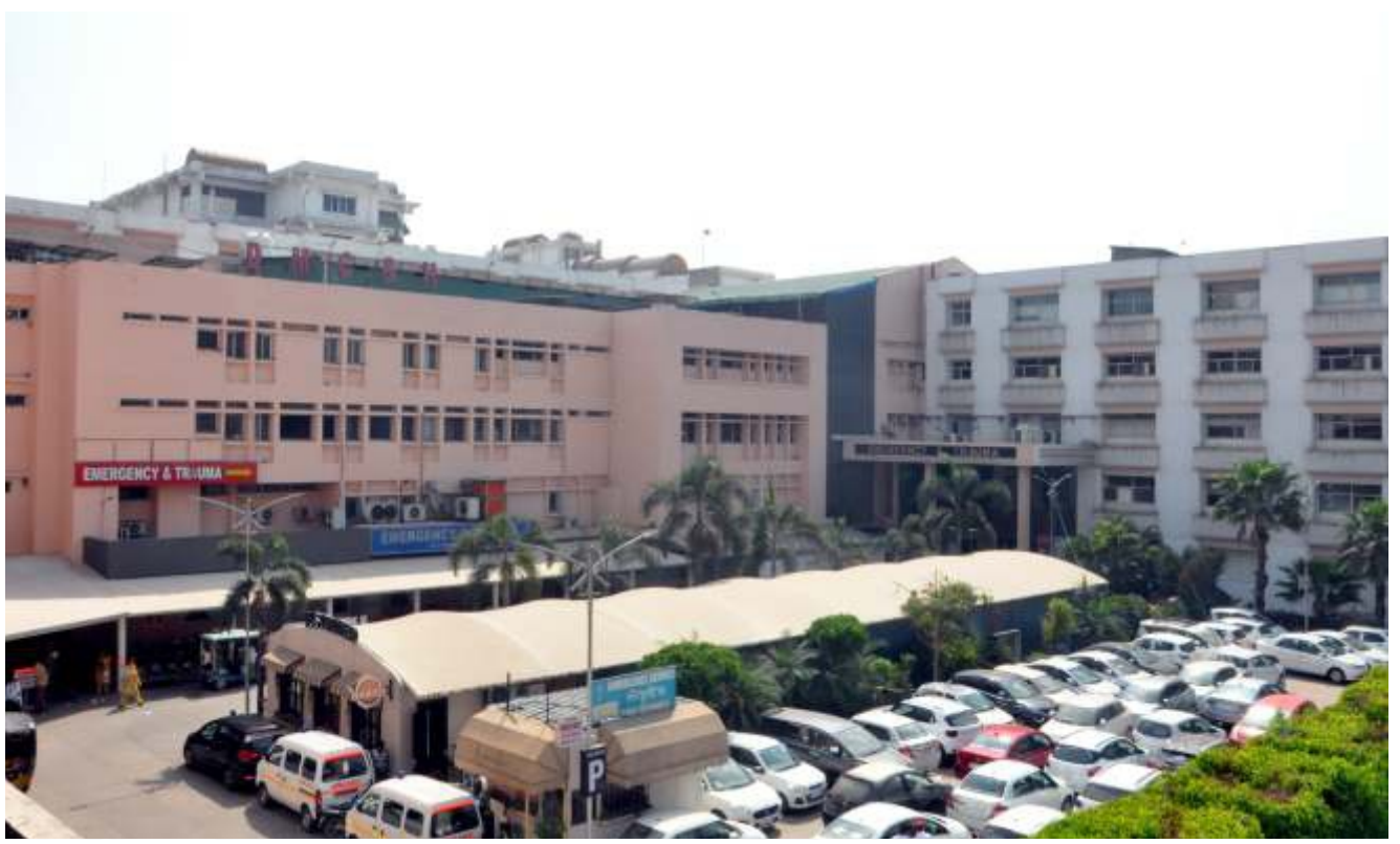
DAYANAND MEDICAL COLLEGE & HOSPITAL