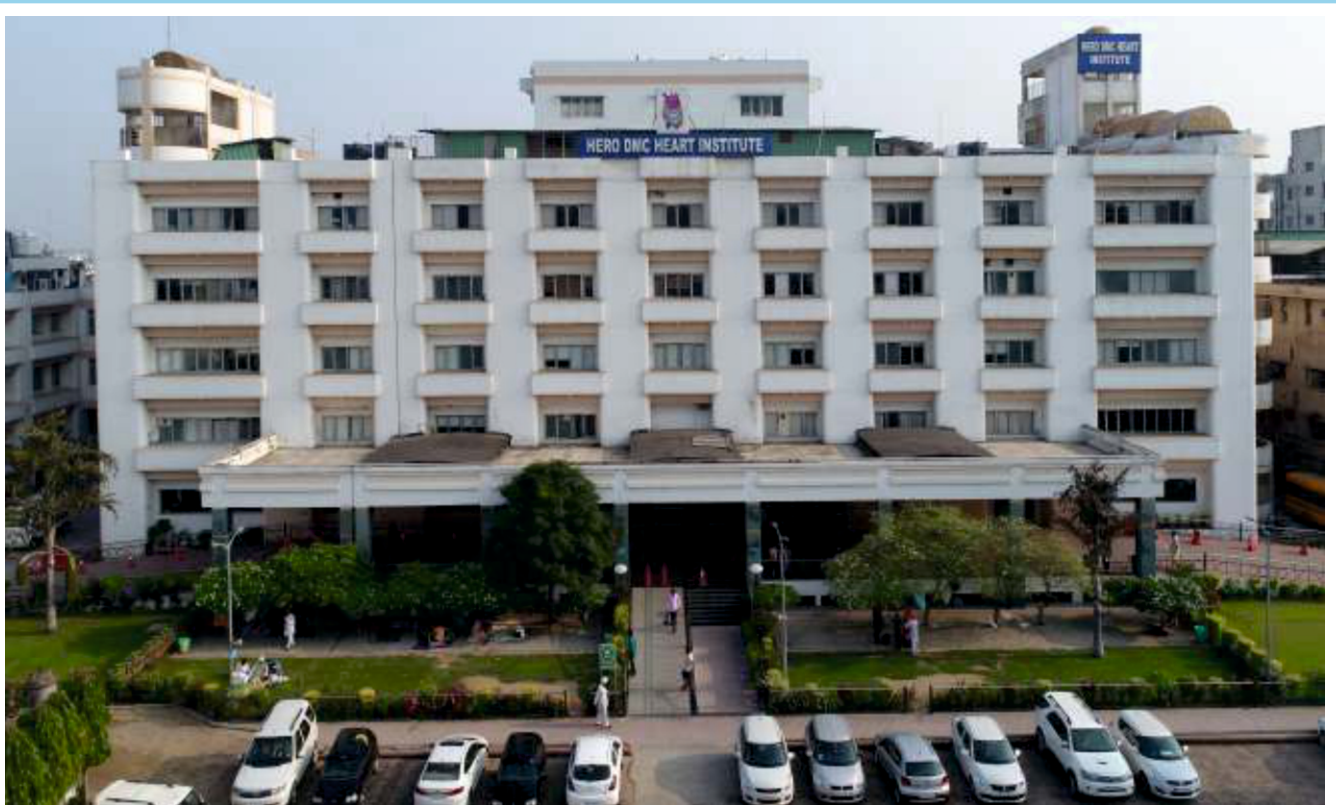
UNIT-HERO DMC HEART INSTITUTE