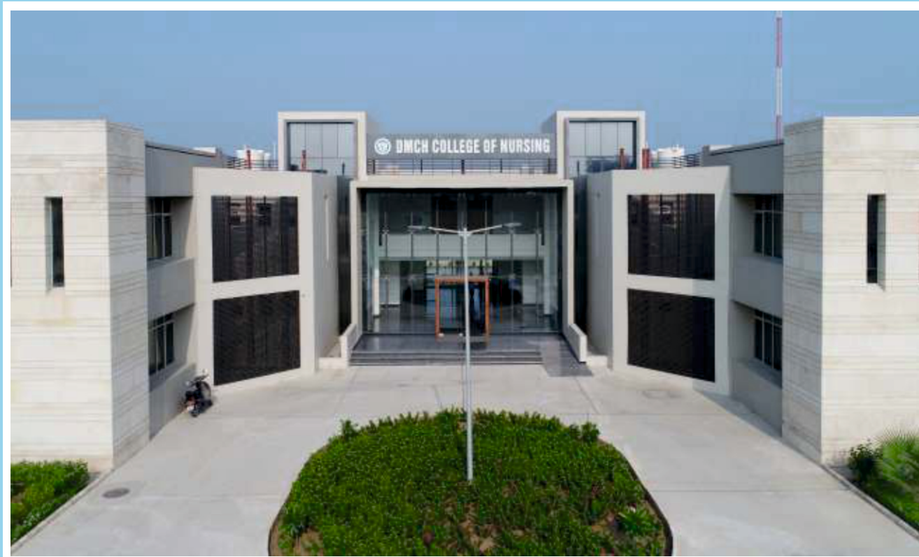
COLLEGE OF NURSING