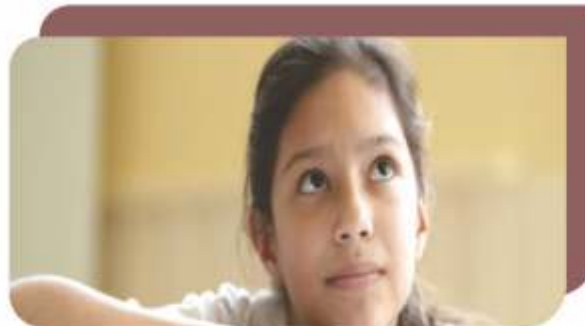
(EARLIER VIRAL DETECTION = SAFER BLOOD SUPPLY)