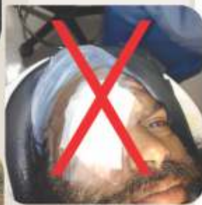
No Stitch & Patch