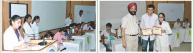
IAP PG Quiz