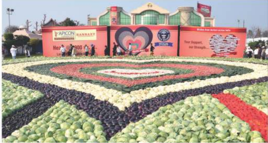
World's largest Vegetable Heart Mosaicic (Guinness World Record)